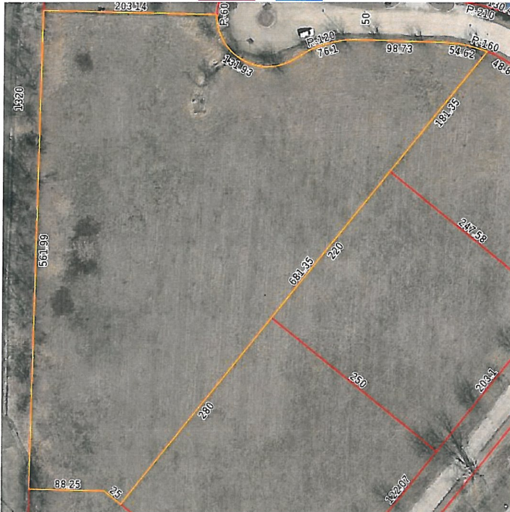
600ft x 600ft