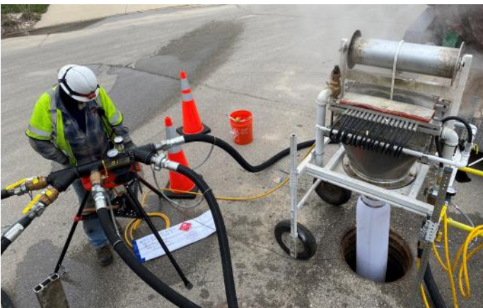
Photo #3 is an example of the significant amounts of hot water steam that will be seen coming out of the sewer pipe at the end of the new line that is being formed.

After August 16, residents can expect to see multiple crews with SJ LOUIS, the project contractor, working around town.