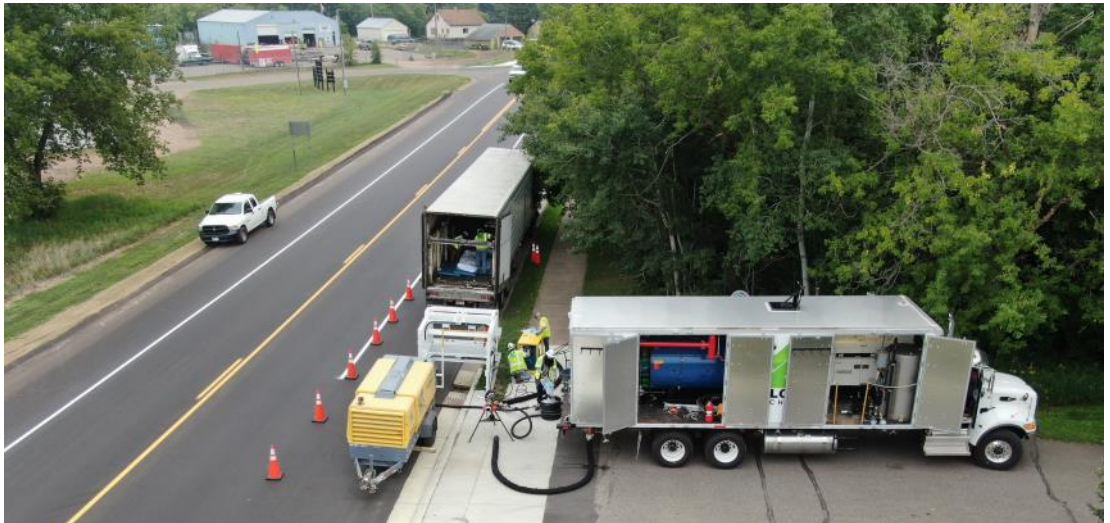
Photo #1 is an example of what the setup will look like along our streets.

Ace Cleanings is the hired contractor will be cleaning the lines and capturing videos (CCTV) of the sewer lines to verify the current condition of the system.